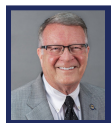
SEN. STEVE WILSON OHIO STATE SENATOR, 7TH DISTRICT

CONNECT WITH PEERS: SHARE YOUR EXPERTISE AND LEARN WHAT'S WORKING (AND WHAT ISN'T) FROM FELLOW EDUCATORS